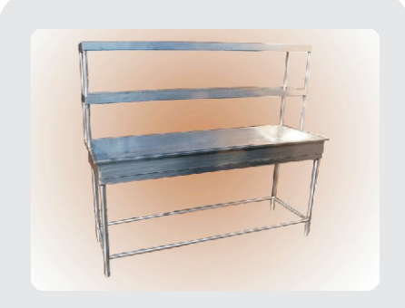
SUDLT02 Dish Landing Table