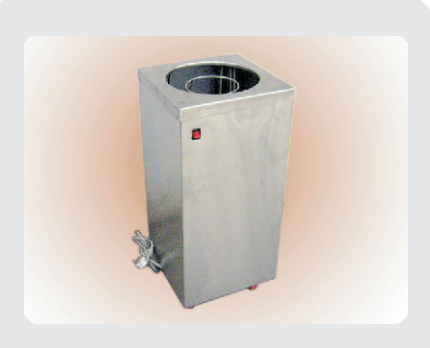
SUPWR01 Plate Warmer