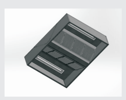
SUEXS04 Exhaust Hood