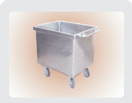
SUOTR03 Water Trolley