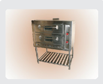
SUOVN08 Double Deck Pizza Oven