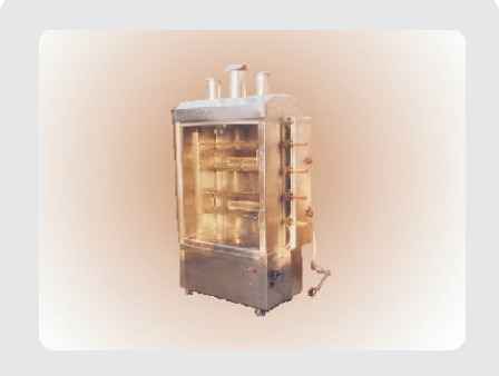
SUOVN10 Bar Beque