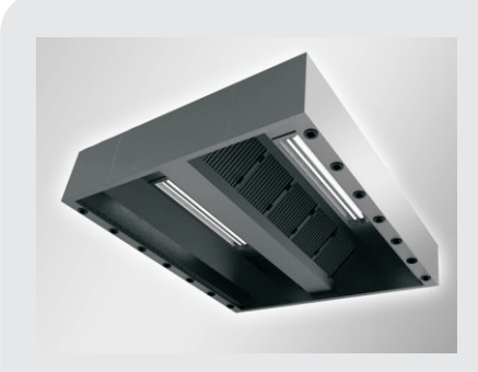
SUEXS05 Exhaust Hood