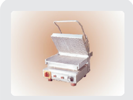
SUCNT06 Sandwich Griller