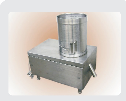
SUPTP01 Potato Peeler