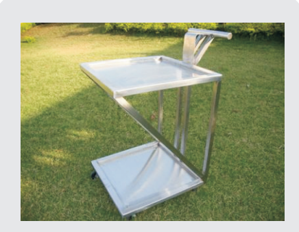
SUBTR05 Mini Bar Trolley