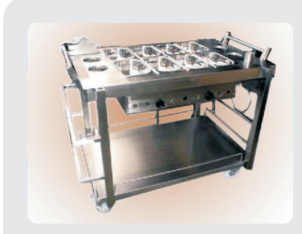
SUSNTR03 Snack Trolley