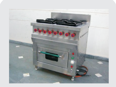
SUCNT02 Continental Range with Oven