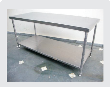
SUWTB03 Work Table with One Shelf