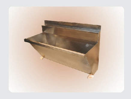
SUSNK07 Operation Theater Sink