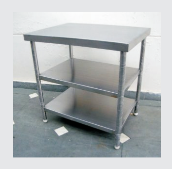
SUWTB02 Work Table with 2 Shelves