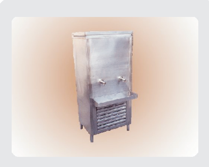
SUWCL02 Double Tap