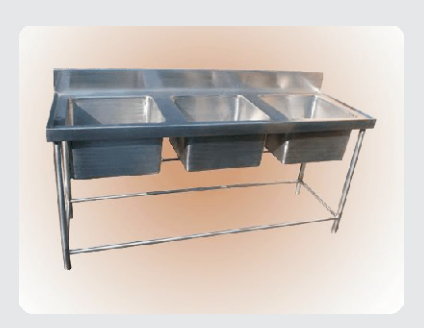
SUSNK03 Three Pot Bulk Washing Sink