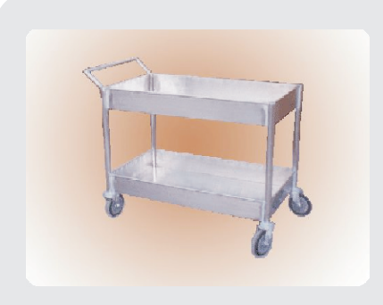
SUOTR02 Bus Trolley