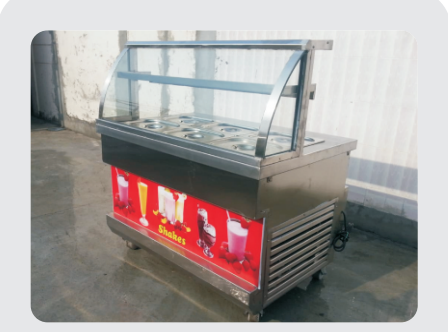
Shakes Counter Refrigerated