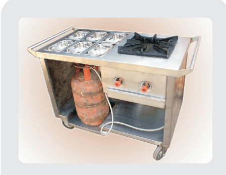
SUOTR01 Flame Way Trolley