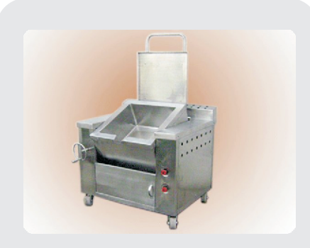
SUBQR09A Brat Pan