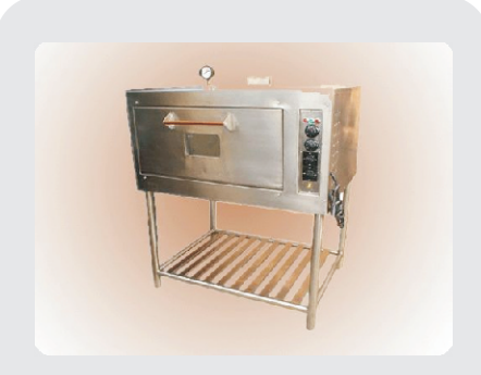
SUOVN05 Pizza Oven