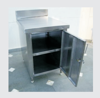
SUWTB05B Work Table with Lockable Door