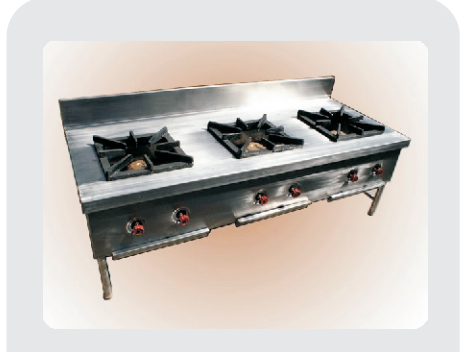
SUBQR06 Three Burner Banquet Cooking Range