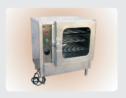
SUOVN02 Oven with Prooving Chamber