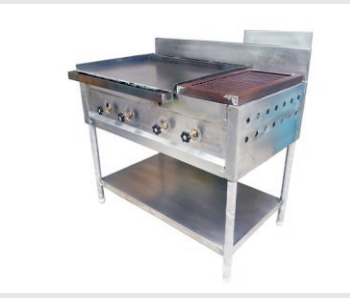
SUOEQ04 Chapatti Bhatti with Puffer