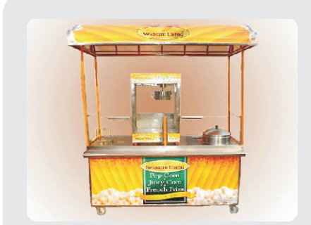
SUDSC02 Pop Corn Counter