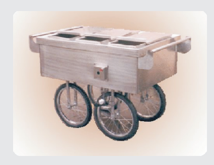
SUBNM15 Three Pot Mobile Bain Marie