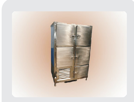
SUVFR04 Five Door Vertical Refrigerator