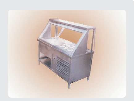
SUBNM13 Ice Cream & Cold Bain Marie