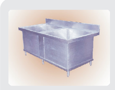
SUSNK02 Two Pot Bulk Washing Sink