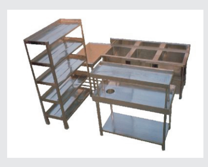
SUDDT01 Dish Washing Unit