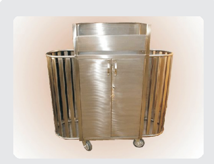
SUOTR09 Room Service Trolley