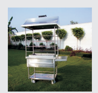
SUOTR07 Mobile Grilling Trolley