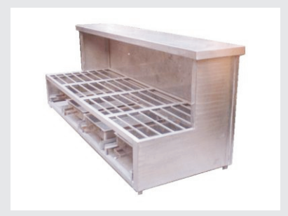
SUBQR08 Coal Operated Food Warmer