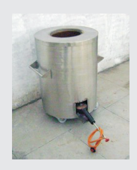
SUTDR03 Gas Operated Tandoor