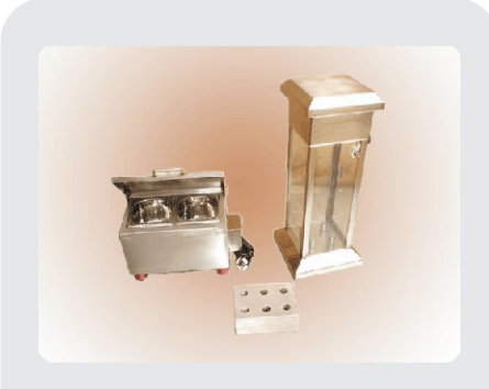
SUBNM09 Two Pot Choclate Bain Marie with Hot Case for Ice Cream Parlour