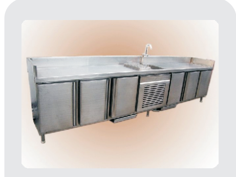
SUBAR02 Bar Refrigerator with sink