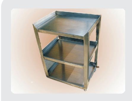
SURCK01 Three Shelf Rack