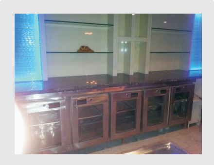
SUBAR03 Bar Counter with Glass Door