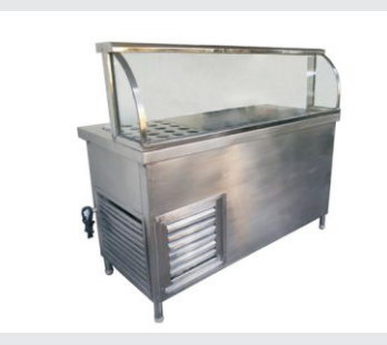
SUBNM10 Cold Bain Marie