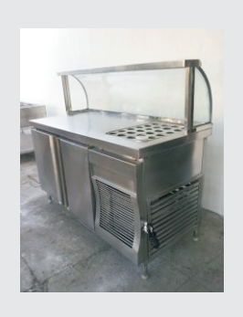
SUHFR04 Under Counter Refrigerator with Cold Bain Marie