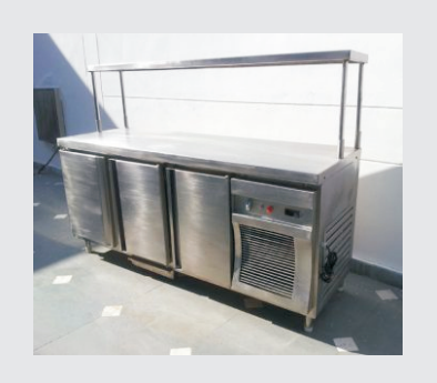
SUHFR01 Under Counter Refrigerator