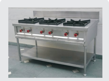
SUICR03 Three Burner Range