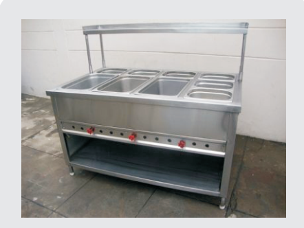
SUBNM08 Hot Bain Marie