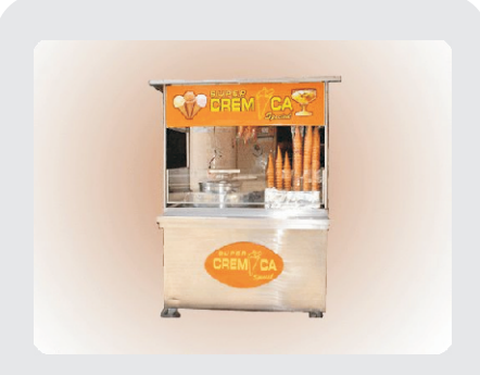
SULVC10 Ice Cream Parlour