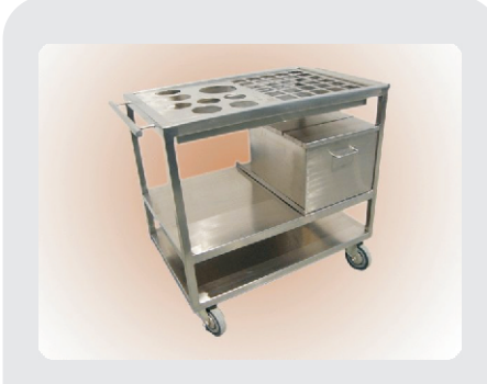
SUBTR04 Bar Trolley