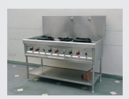
SUCHR04 Three Burner Range with Water Flowing System