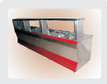
SULVC11 Tikki Chat Pav Bhaji Counter