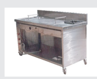
SUOEQ01 Dosa Bhatti