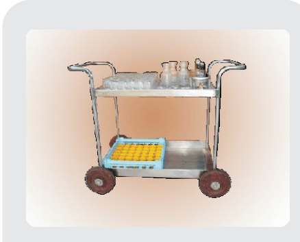
SUBTR01 Bar Trolley