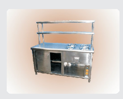
SUBNM02 4 Pot Bain Marie with Hot Case