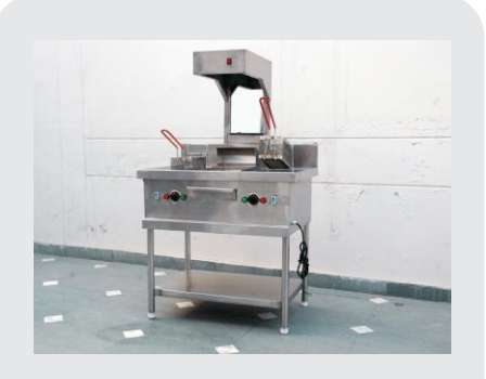
SUFRY04 Double Deck Fryer with Dump