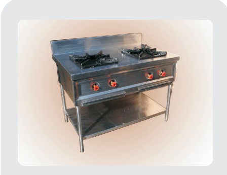
SUICR02 Double Burner Range