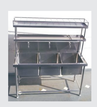
SUDDT05 Three Pot Sink with two Overhead Shelf