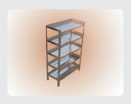
SURCK02 Five Shelf Rack