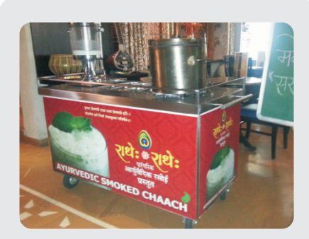
Smoke Lassi Counter