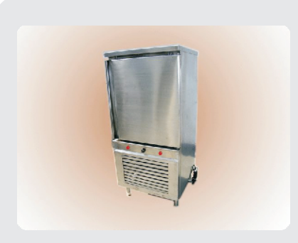
SUVFR01 Single Door Vertical Refrigerator