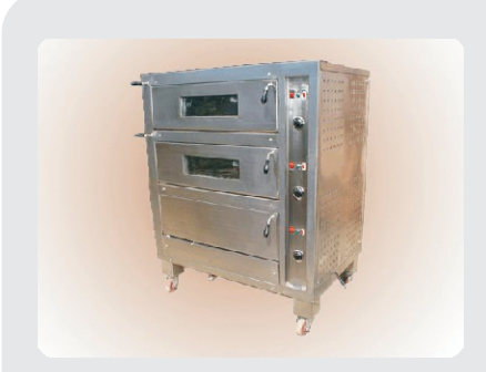
SUOVN09 Bakery Oven with Prooving Chamber