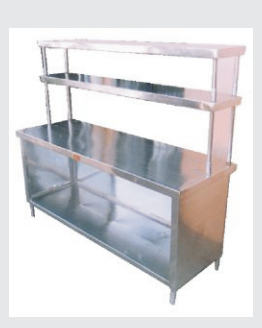
SUWTB08 Work Table with Overhead Shelf