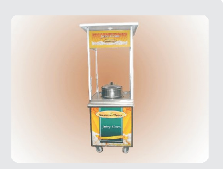
SUDSC01 Pop Corn