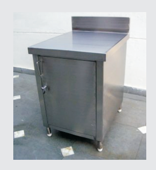
SUWTB05A Work Table with Lockable Door