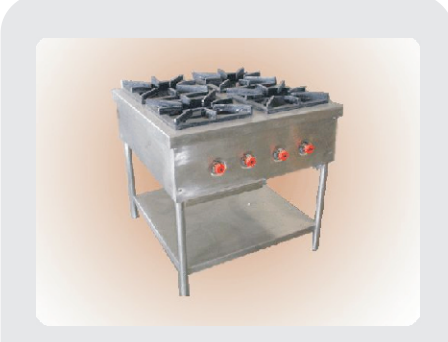
SUCNT01 4 Burner Range