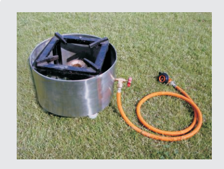
SUBQR04 Single Burner Small Bhatti