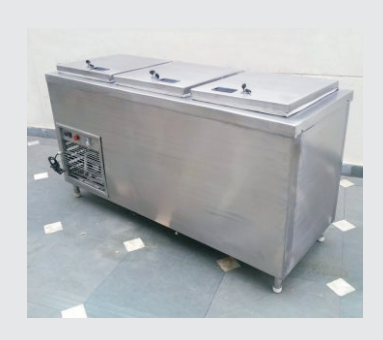
SUHFR03 Three Door Chest Refrigerator