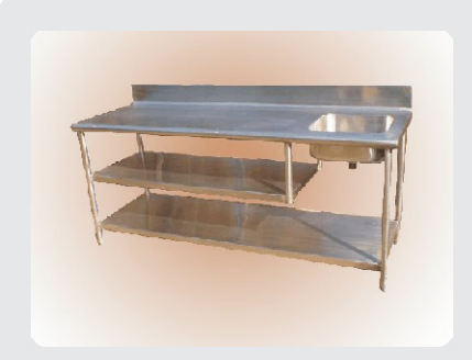
SUWTB07 Table With Sink