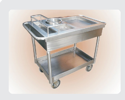
SUBTR02 Bar Trolley