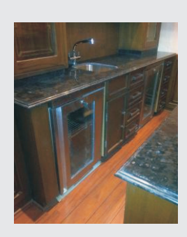
SUHFR05 Under Counter Refrigerator with Glass Door