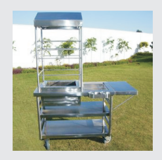
SUOTR08 Mobile Grilling Trolley