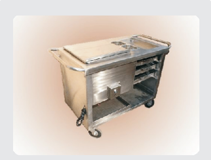
SUSTR01 Single Pot Soup Trolley