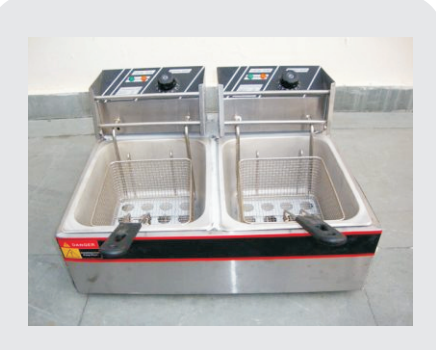
SUFRY08 Double Deck Fryer Table Top