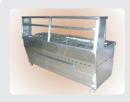
SUBNM05 Bain Marie