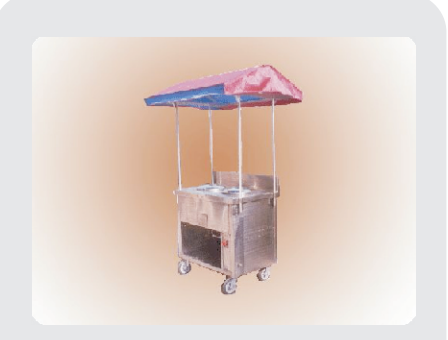
SUSTR03 Double Pot Soup Trolley with Hut