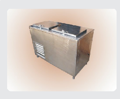
SUHFR02 Two Door Chest Refrigerator