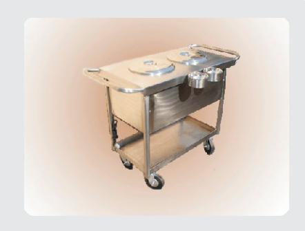
SUSTR02 Two Pot Soup Trolley