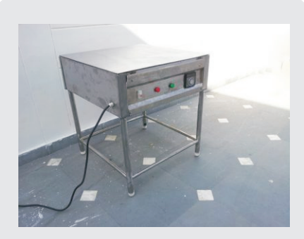
SUOEQ03 Chapatti Bhatti Electric Operated