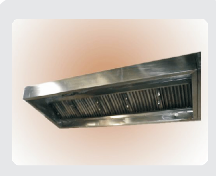
SUEXS03 Exhaust Hood with filter