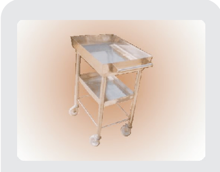
SUSNTR01 Snack Trolley