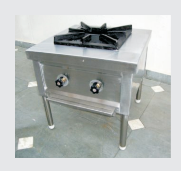
SUBQR03 Single Burner Banquet Cooking Range