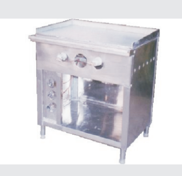
SUCNT05 Griddle Plate