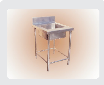
SUSNK01 Single Pot Sink