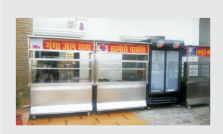
SULVC12 Live Counter