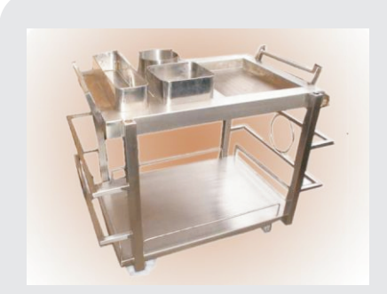
SUBTR03 Bar Trolley