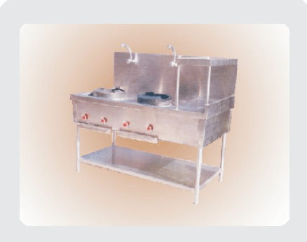
SUCHR03 Double Burner Range with Side Shelf