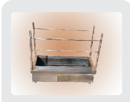
SUBQR11 Coal Operated Grill