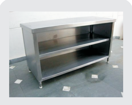
SUWTB04 Work Table with Three Side Covered