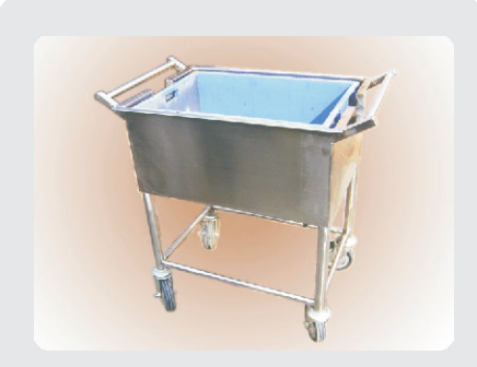
SUOTR06 Dustbin Trolley