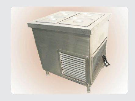
SUBNM11 Cold Bain Marie