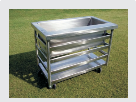
SUOTR05 Water Trolley