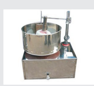
SUGRD01 Wet Grinder