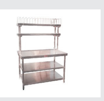
SUDDT02 Drain Dish Table