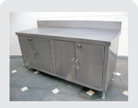
SUWTB06 Work Table with Lockable Door