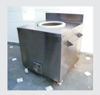
SUTDR04 Square Tandoor