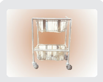
SURCK04 Pot Rack Trolley