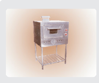
SUOVN03 Pizza Oven Gas Operated