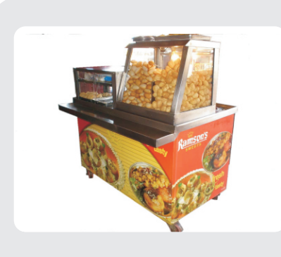
Gol Gappa Counter