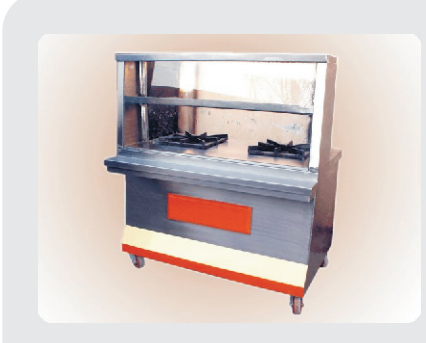
SULVC08 Double Burner Live Counter