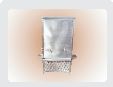
SUWCL01 Four Tap