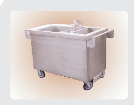
SUOTR04 Water Trolley