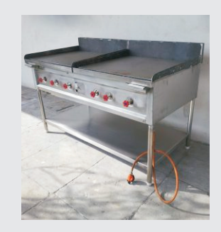
SUOEQ02 Chapatti Bhatti