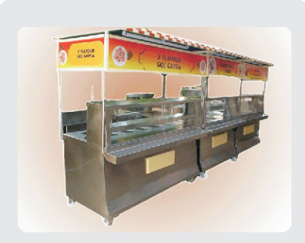
SULVC13 Gol Gappa Chaat Counter