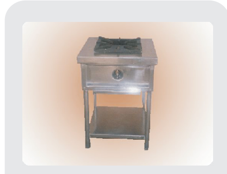
SUICR01 Single Burner Range