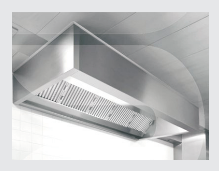
SUEXS07 Exhaust Hood