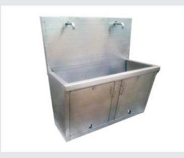
SUSNK06 Operation Theater Sink