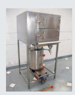
SUOEQ05A Idli Steamer