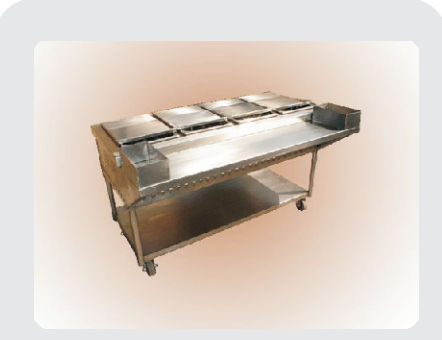
SUBNM06 Bain Marie