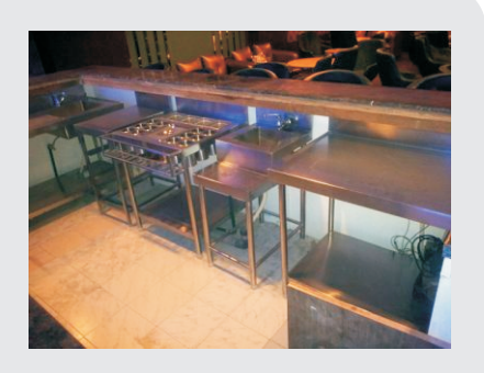
SUBAR04 Complete Bar Station