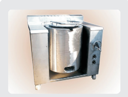
SUBQR10 Gas Operated Bulk Cooker