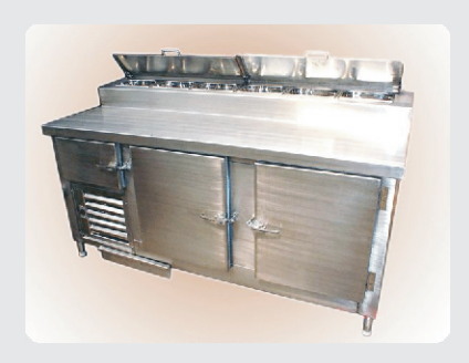
SUPTT01 Pizza Toping Table Cum Refrigerator