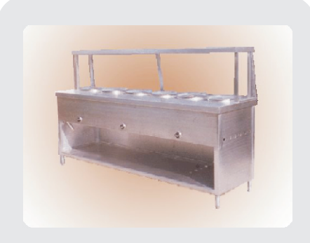
SUBNM03 Bain Marie