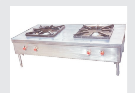
SUBQR05 Double Burner Banquet Cooking Range