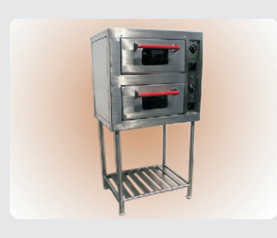
SUOVN07 Double Deck Pizza Oven