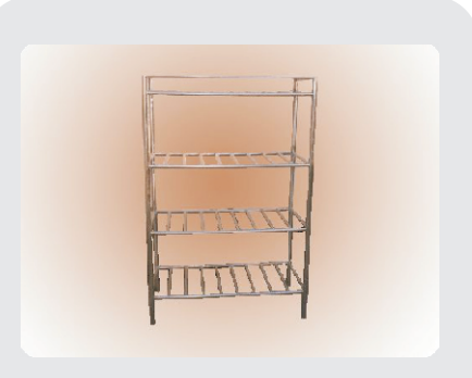
SURCK03 Bulk Pot Rack