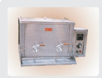
SUBNM14 Tea Coffee Dispensar