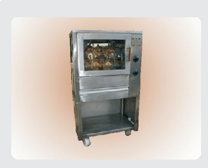
SUOVN06 Bar Beque