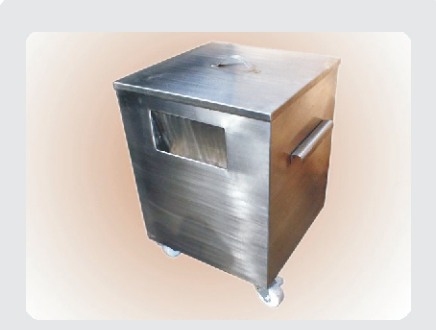
SUDBN01 Dust Bin