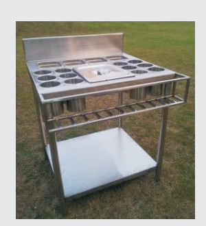
SUBAR01 Cocktail Station with speed Rail