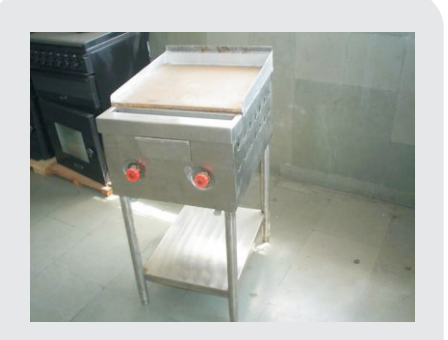
SUCNT04 Griddle Plate