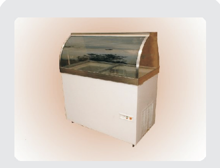
SUHFR06 Ice Cream Parlour