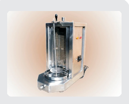
SUCNT07 Shorma Machine