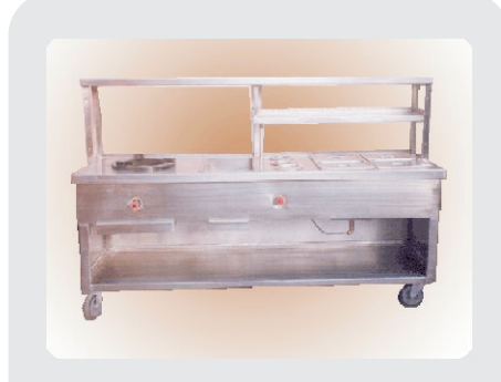
SUBNM01 4 Pot Bain Marie