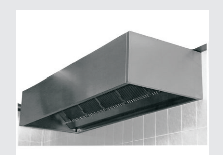
SUEXS06 Exhaust Hood