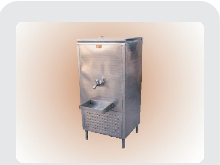
SUWCL01 Single Tap